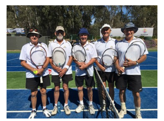
Winning Men"s O/80's team